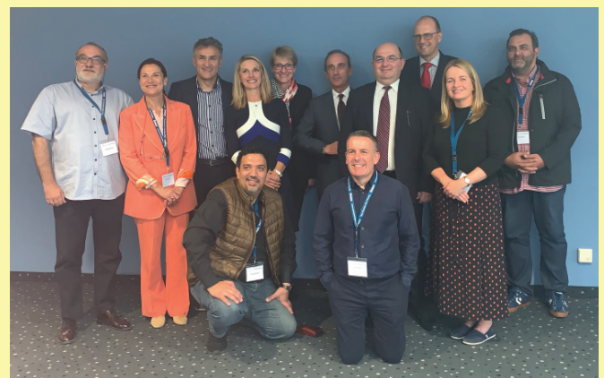
FEO General Assembly Nuremberg 2019

For further details on any Awards or Criteria for selection please contact secretary@feo-online.com